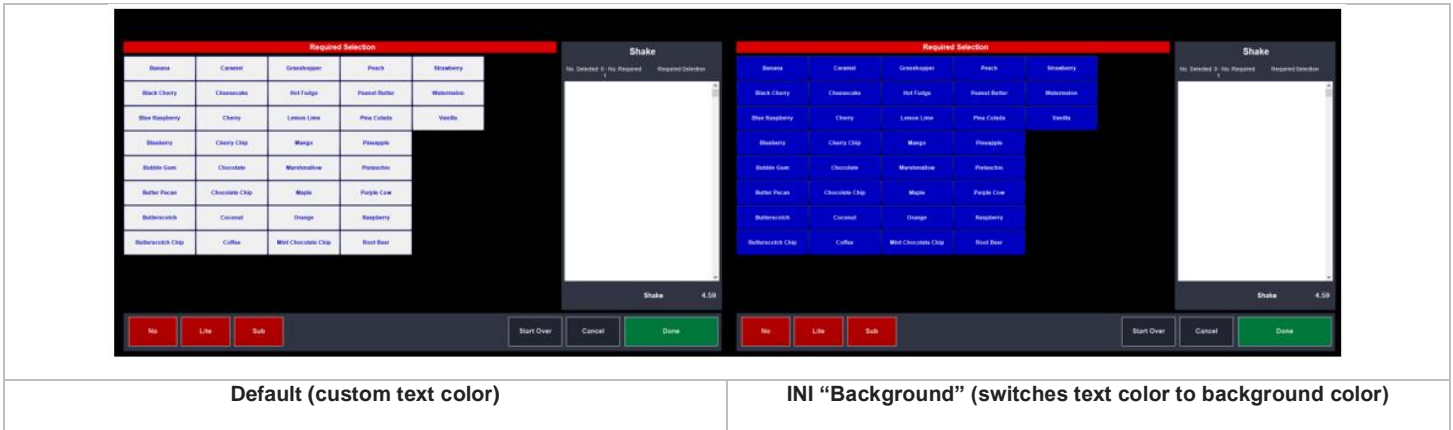
Default (custom text color)

By default, modifier buttons are gray with the ability to customizable text color (changed in the modifier setup area). The INI file inverts the colors (text color=background color).